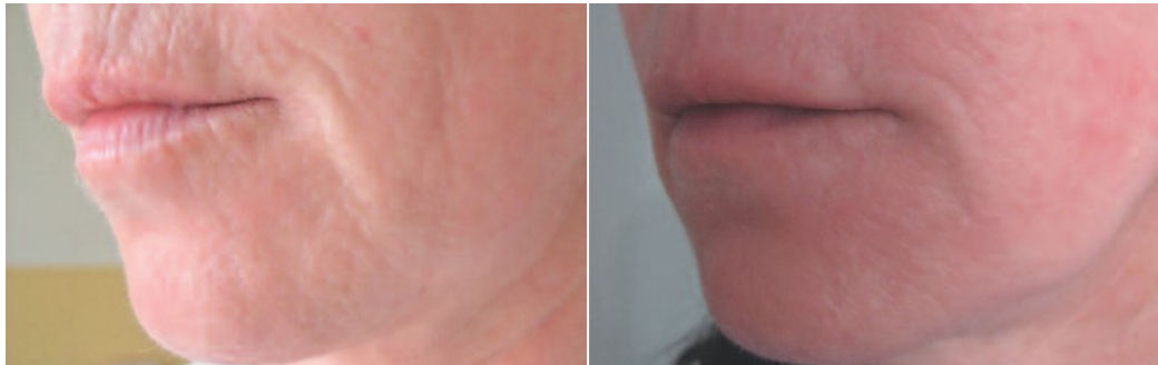
Images 2a and b: patient with perioral wrinkles prior to (a) and after the procedure (b).

treated was prepared through degreasing, aqua dermabrasion and the application of a numbing cream (ca. 45 minutes to take effect). Afterwards, the treatment was performed with PlexR®, using the red (stronger power, suitable primarily for the ablative effect) and the white (predominantly for the intrinsic effect) hand pieces. In the process of doing this, the author used a combination of spot and spray technique. The duration of the treatment in this case was about 20 minutes, after which the result had once again been documented by photos. After the treated areas were covered with a special care product, the patient received clear instructions as to how and with which products the skin should subsequently be cared for. Both the healing process and the final result (after seven months) were photo documented.